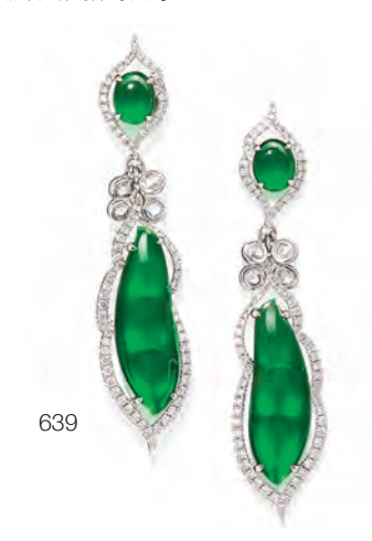
WECHAT: 邦瀚斯拍賣行 BONHAMS

在符合我們的規定下,如要以通過電話的形式以信用卡支付,本公司每次拍賣接受的總數不超過HK$50,000,但此方式不適用於第一次成功競拍的買家。